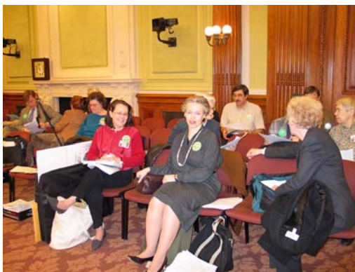
Coalition Members from Wards 1, 3 and 4